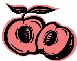
"dust off those Hawaiian shirts for the weekend, and think tropical."