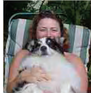
Chillin' with Husker

Club Checking account balance - $7,713.70