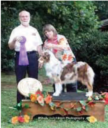
Our Star (AKC CH Shoreland's Scarlett Ribbon) went WB at the Sat AM and Sun

WELL we have had a great past two GAASC shows! So here is the run down!