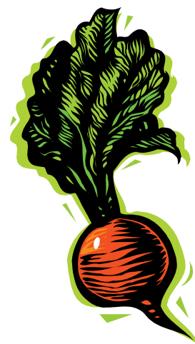
When you're hot your HOT!