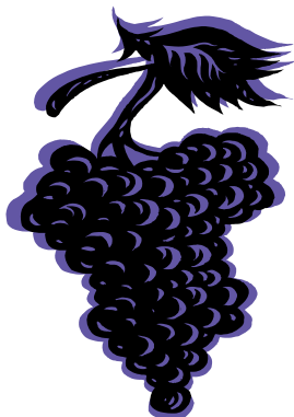
Getting to be Harvest time