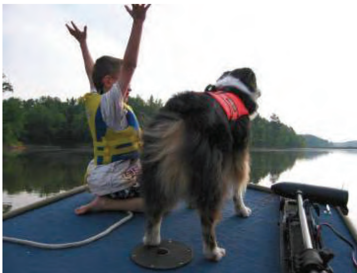
View from the Titanic waving goodbye at Summers End

Still more plans are under way for our Nationals PreShow in New Jersey. Most of the prizes have been settled, and ribbons are chosen. Our judges and stewards are planning on making this a fun show for all of ASCA, and we'd love for help from any folks coming to Nationals. With this year being