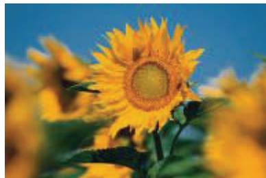
Getting to be that time of year again! Thank goodness.