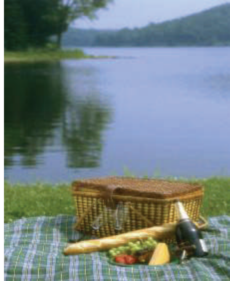
Time to go fishing... just depends on what you're fishing for.