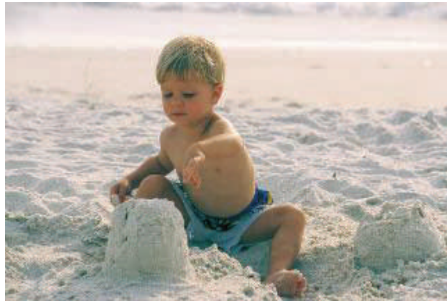
I see sheep herding in this kids future.