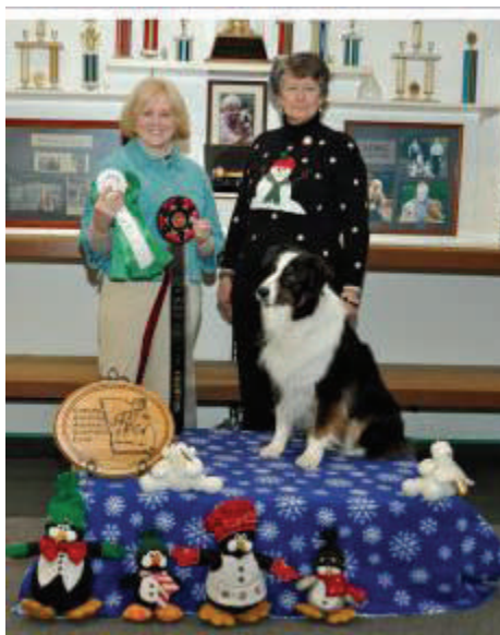
Pat and Spooky at Paw Thaw

Spooky is officially A-CH Nitestars ABump in the Night CGC AKC – CD CDX UD VER FFX-OG2 RN RA RE RAE RAE2 / ASCA – CD FFX-OG CDX UD RN RNX RA RAX RE RM RMX DNA-VP