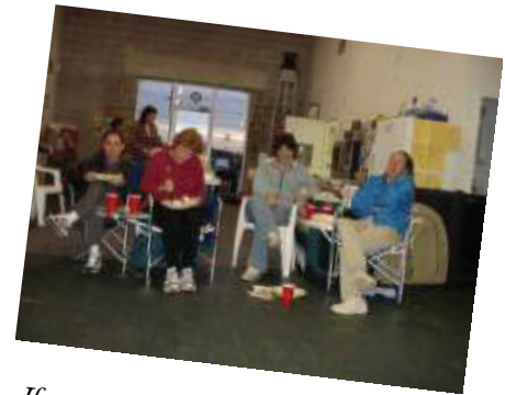
If you weren't there you missed a great party this year!

Check the Calendar inside this newsletter for details or online at the club website: www.gaasc.org .