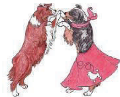
Something new here.